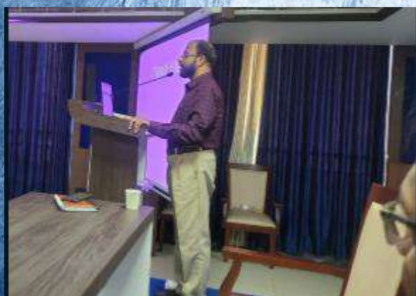
COMMITTEE FOR SAFE ZONE HOSPITALS MEETING IMA PERIYAR HOUSE - 15.01.2023