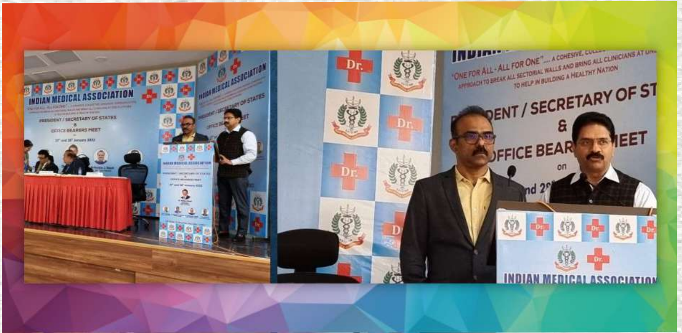
State President receiving National President's Appreciation for the exemplary performance of IMA KSB on 28.01.2023