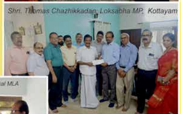
Shri. Thomas Chazhikkadan, Loksabha MP, Kottayam