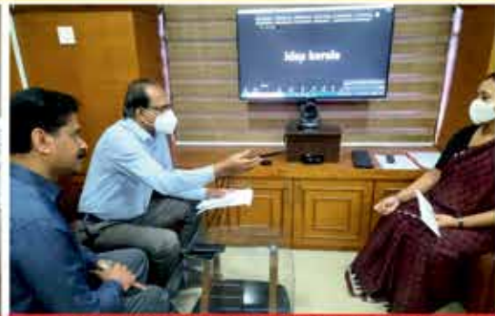
Smt. Veena George, Health Minister Govt. of Kerala