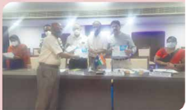
Branch President Secretaries Meet @ IMA Hqs on 05.12.2021