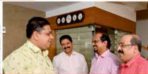
Shri. A.N. Shamseer, Speaker Kerala Legislative Assembly