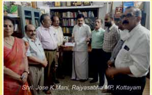
Shri. Jose K Mani, Rajyasabha MP, Kottayam