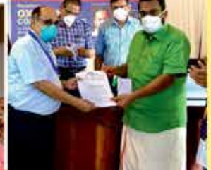
Shri. K. Rajan, Minister for Revenue & Housing, Govt. of Kerala