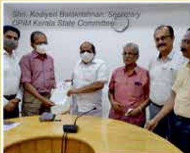
Shri. Kodiyeri Banankrishnan, Secretary CPIM Kerala State Committee