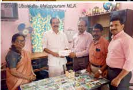
Shri. Ubaidulla, Malappuram MLA