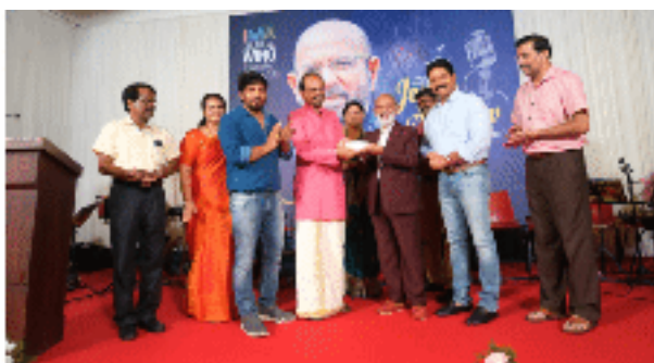
State President and Secretary at KGMCTA State Conference, Thrissur on 21.10.2022. Health Minister Smt. Veena George Addressing