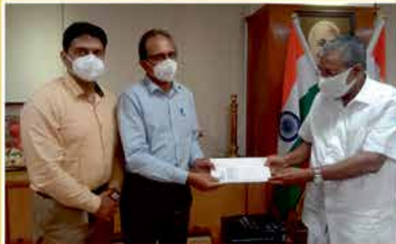
Shri. Pinarayi Vijayan, Chief Minister Govt. of Kerala