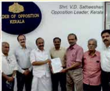
Shri. V.D. Satheeshan Opposition Leader, Kerala