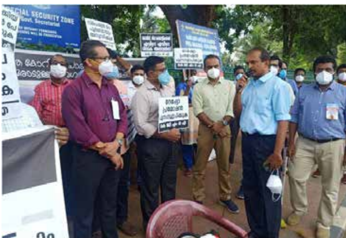
State President Addressing 'NILPU SAMARAM' by KGMOA in front of Secretariat