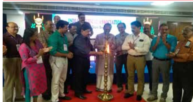
IMA MSN ELS Trainers Programme on 16.10.2022