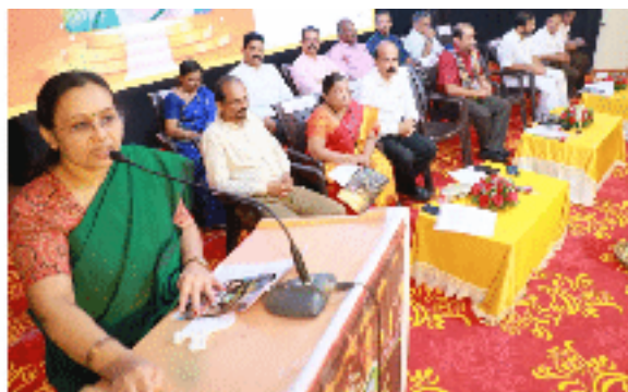
IMA MSN MEET on 24.10.2022