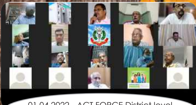
01.04.2022 - ACT FORCE District level Meetings - Thrissur Dist