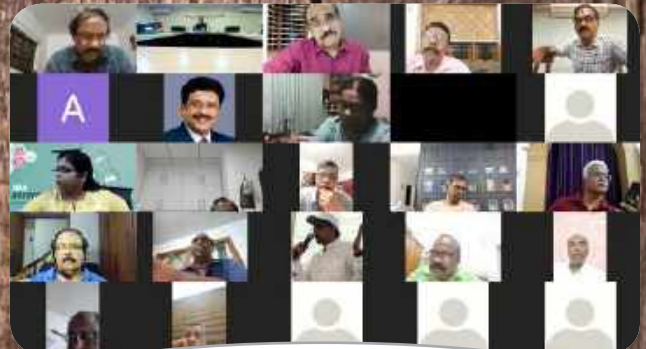
26.04.2022 - District committee meeting