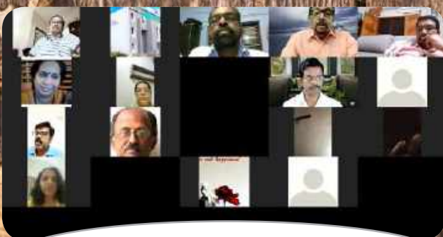
09.04.2022 - ACT FORCE District level Meetings - Trivandrum Dist