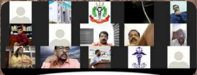
08.04.2022 - ACT FORCE District level Meetings - Kollam Dist