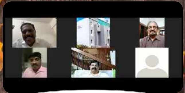
14.04.2022 - South Zone CGP - Preliminary Discussion