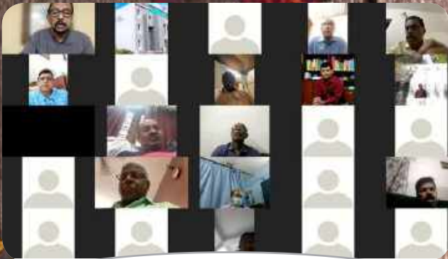
03.04.2022 - ACT FORCE District level Meetings - Kottayam & Idukki Dist