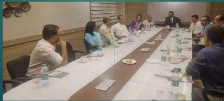
IMAGE PLANT VISIT