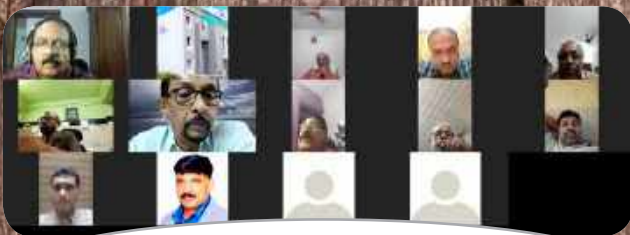
07.04.2022 - ACT FORCE District level Meetings - Pathanamthitta Dist