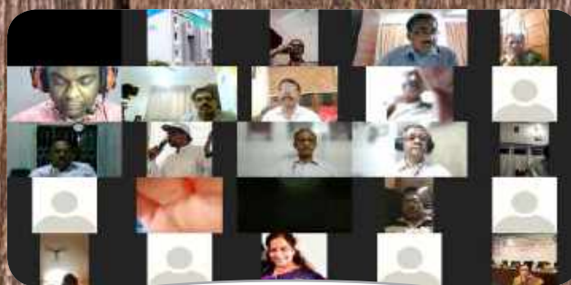
29.04.2022 - IMA AMS Meeting