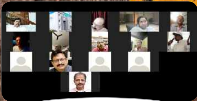
13.04.2022 - CWC delegates Meet