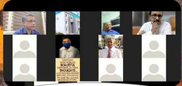
02.04.2022 - ACT FORCE District level Meetings - Ernakulam Dist