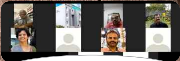
06.04.2022 - PCS Meeting