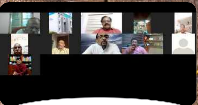
10.04.2022 - ACT FORCE District level Meetings - Alappuzha Dist