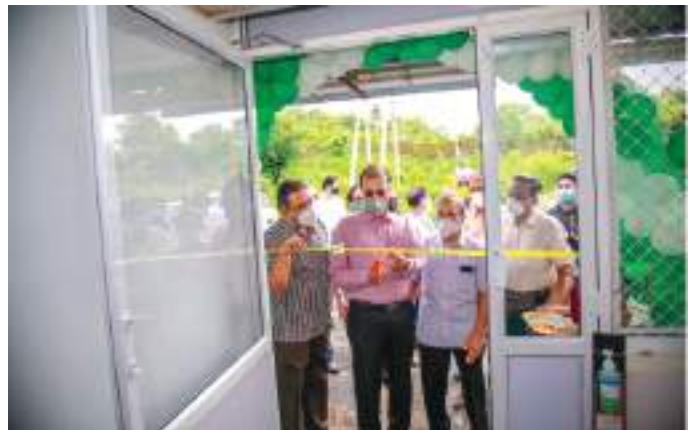
IMAGE Commenced operation in 2004. Presently the Largest CBWTF in India The only CBWTF for the entire state of Kerala

IMAGE is the Prestigious Project of Indian Medical Association , (IMA KSB), developed for the scientific management of Biomedical Waste generated from HCEs in Kerala