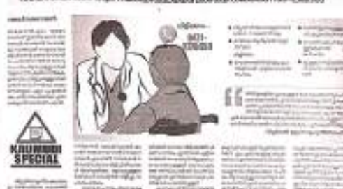
വെസ്റ്റ് ബെൽജിയത്തിൽ ജനങ്ങൾക്ക് ഹോസ്പിറ്റൽ നിലവാരം