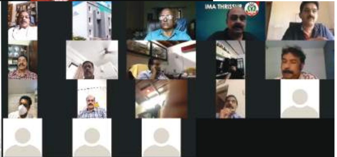
IMAGE MEETING - 22.09.2020