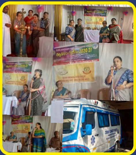
WDW COCHIN WEST