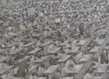
വൈദഗ്ദ്ധ്യം നിയന്ത്രിക്കാൻ ഐ.എം.എ.യുടെ 3.6 ലക്ഷം കോടി.

വൈദഗ്ദ്ധ്യം നിയന്ത്രിക്കാൻ ഐ.എം.എ.യുടെ 3.6 ലക്ഷം കോടി. വൈദഗ്ദ്ധ്യം നിയന്ത്രിക്കാൻ ഐ.എം.എ.യുടെ 3.6 ലക്ഷം കോടി.