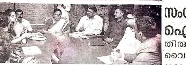
ഐ.എം.എ. പ്രസിഡൻ്റ് ഡോ. എബ്രഹാം വർഗീസ് ഉദ്ഘാടനം ചെയ്യുന്നു.

IMA flags depiction of unscientific facts in films. IMA flags depiction of unscientific facts in films.